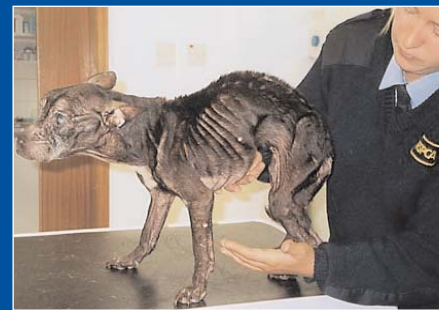
Nursing animals such as these back to health and caring for them until rehomed can cost your local RSPCA upwards of £200 each